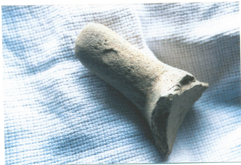
HSII Anonymous round rose-stamp type 7A