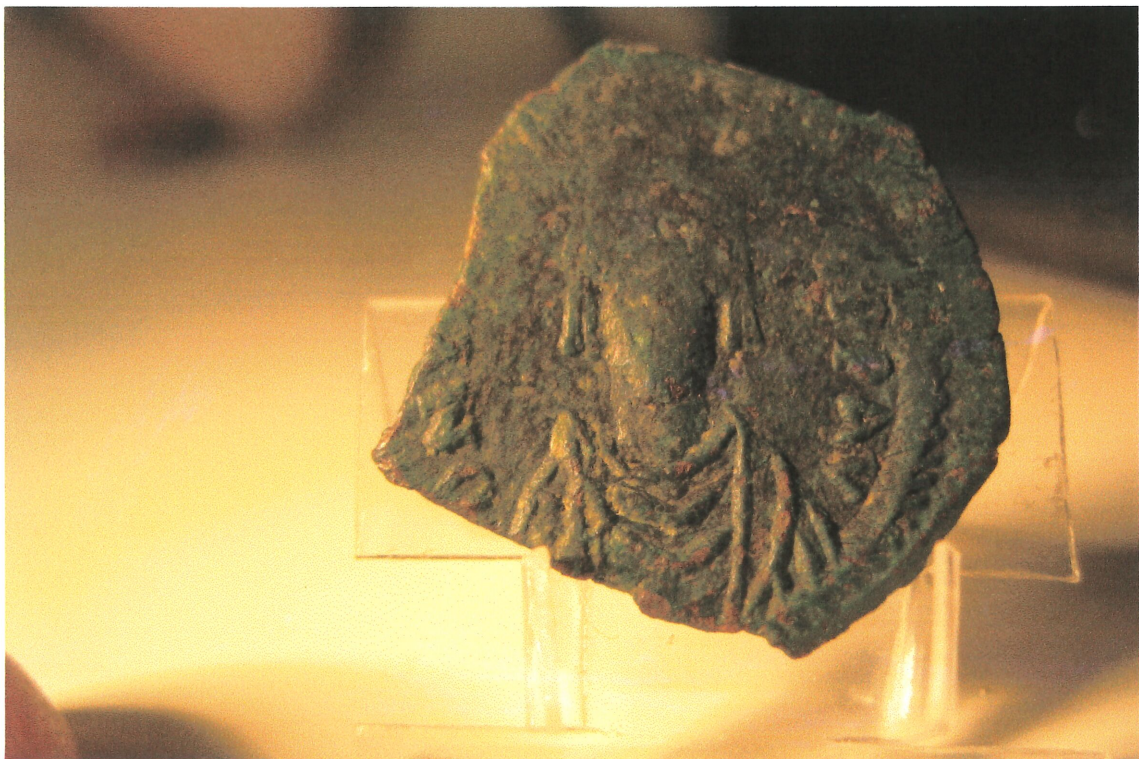
Byzantine coin, Found at ARKASSA Reign of Maurice Tiberius (582-602 AD)